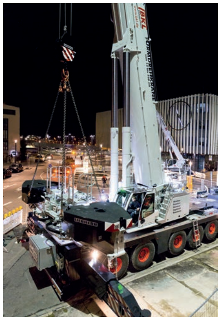
BKL dismantling a tower crane in Ingolstadt, Germany. The Bavarian company has moved into the top 100 this year at 93rd place (from 108) following recent years of strong expansion

only positive was an increase in the number of depots, perhaps suggesting that these leading companies have invested further in getting closer to their customers. At 507 depots the number was up 2 % from the 497 of 2018. An increase in this number has been consistent for many years. The number of employees, however, was down, by 4.5 %, or 1,428 people, to 30,460 from 31,888 and reversing two years of rises. There were 4 % fewer wheeled cranes and 1 % fewer lattice cranes (just 41 units).